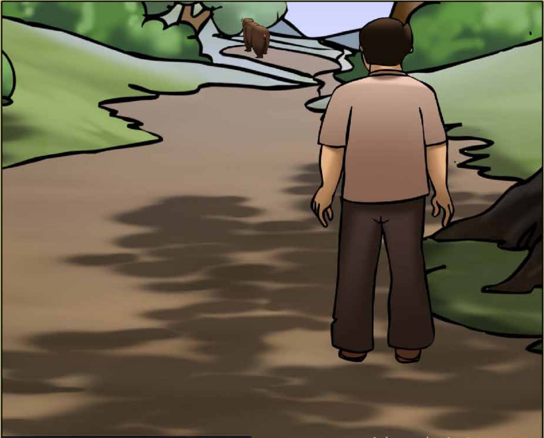
He gradually rose and stood peacefully